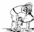
Happy Fathers Day

(If you would like to have your child dedicated, please call the church office before Thursday, June 17) There will be no evening services on Father's Day so that you may spend time with your family.