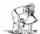
Happy Fathers Day

(children's alternative film: Mandie and the Secret Tunnel )