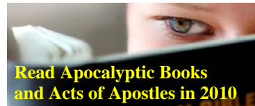
Read Apocalyptic Books and Acts of Apostles in 2010

Zechariah 6; 7; 8; & 9 Sunday night sermons will be taken from the previous week's readings.