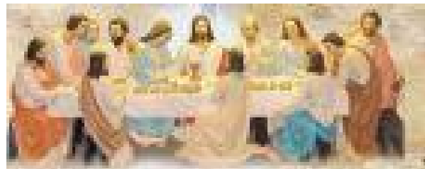
Lord's Supper Sunday, August 2 In the Evening Service