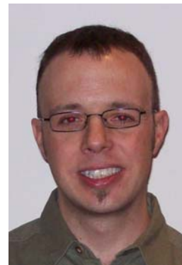
Shane Williams Joined by: Letter